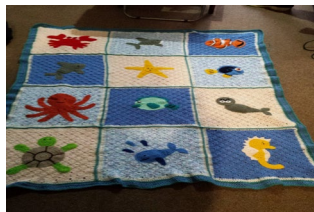
Sewing Circle –

These are the items that Immanuel provides on a regular basis: tomato products (tomato sauce, spaghetti sauce, diced tomatoes) pasta products (spaghetti, elbow noodles, mac'n'cheese), canned meats (chili, Spam, tuna, beef stew,). Condiments are always welcome. See Karen Campbell for questions.